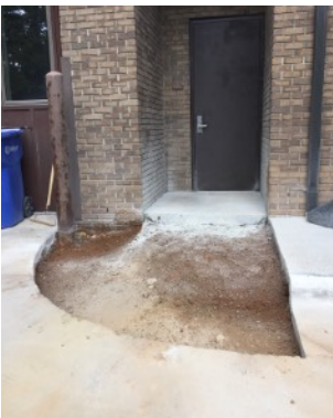
Rear curbing removed.