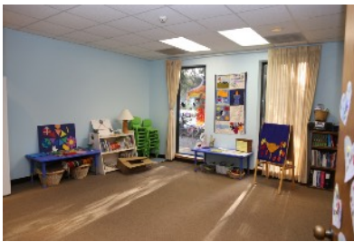
"Recruitment" photo of classroom.

It's times like those when you take a hard look around and think "Ye Gods! What a Mess!" Our entrances were not ADA compliant, the exterior bulbs and the parking lot lights were half out, we had carpet peeling up in the classroom and nursery, and our library was housed in broken-down particle-board bookcases. All the lighting was florescent, with that lovely greenish cast. The kitchen appliances were mismatched, and Wonderful Wednesday dishes had to be completed by hand because one dishwasher was insufficient. That was at the start of 2016.