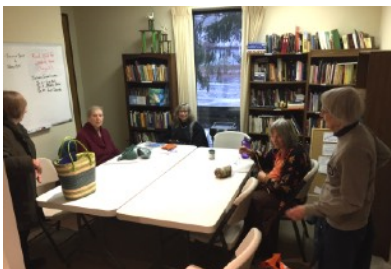
Library crammed in current nursery.

When Covid hit, we were forced to think about indoor air quality, since not a single window in the building can be opened. All in all, around $85,000 has been spent in capital improvements which have made UUTC a safer and more appealing place to be for all of us. Last year, we installed the hearing loop—which, by making it easier to hear, reduces cognitive decline. Sometimes, "luxuries" are how we care for one another.