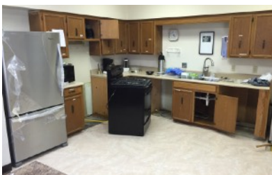
New appliances going in.

After this messy stage, cabinetry was installed in both the classroom and foyer. One to hold children's programming needs, the other to move our library to a place of prominence— and out of what is now our nursery, providing more space for children. In the classrooms and nursery, old carpet was removed, and a surface more conducive to proper sanitation was installed. New bulbs were installed everywhere. All of that happened within the span of about 18 months. For about five years from that time, we slowly replaced the florescent lighting with LED recessed fixtures, which are less harmful to eye health and considerably better looking.