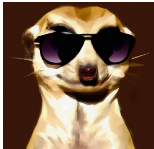
We've Got This. ;)

If you are a bit of an introvert, you may be an ideal Sentinel... because you are less likely to be in conversation with people! You certainly don't need to be built like The Rock, either—you just need good or corrected vision. Like our Meerkat friend, here. But everyone is invited to be part of this Team. Formally, or not. To look for the spilled water, the trip-threatening extension cord, the choking hazard, etc. We can all be Sentinels... but a Team is more effective. Please email or call RK if you are willing to watch out for your tribe, and thank you!