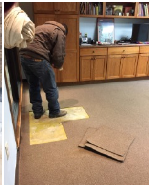
Curled carpet comes out.

All this to say that thoughtful facilities management and the investment of members of this congregation continue to move UUTC forward on issues of health, welfare and making us all feel more welcome—while making better use of our spaces.