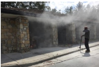
Curbed entrance being cut out.

The first thing to get dealt with was the appliance "shortage." The Men's Group took the lead on this issue and made Wonderful Wednesday much easier for our hostesses through the addition of a second dishwasher and larger capacity refrigerator. After that, the concrete work to create ADA compliant egress from our front and back doors got handled. Curbs can be a real safety threat as we get older, and at least one person had fallen because of a curb and non-existent lighting.