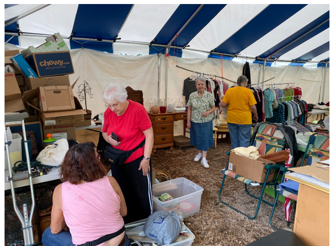
August 17th Prep Day, 2021

Every quarter counts this year , so take a good hard look around the house/shop/shed/garage and see if you can lighten your psychic load. Thanks in advance for supporting the effort!