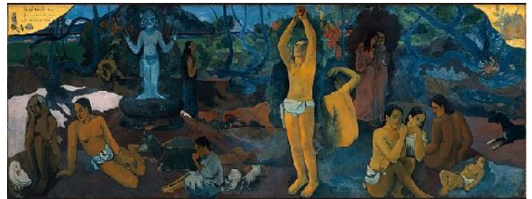
D'ou venons-nous, Paul Gauguin, Wikimedia Commons

The retreat's overarching theme – Where Do We Come From, Who Are We, Where Are We Going (Hymn #1003, Singing the Journey) - comes from the French title of a famous oil painting by Paul Gauguin created in Tahiti in 1897 and 1898. The three groups of women, represent the three questions. The women with the child represent the beginning of life “Where Do We Come From?” The middle group represents the daily existence of adulthood “What Are We?” The old woman facing death is asking, “Where Are We Going?”