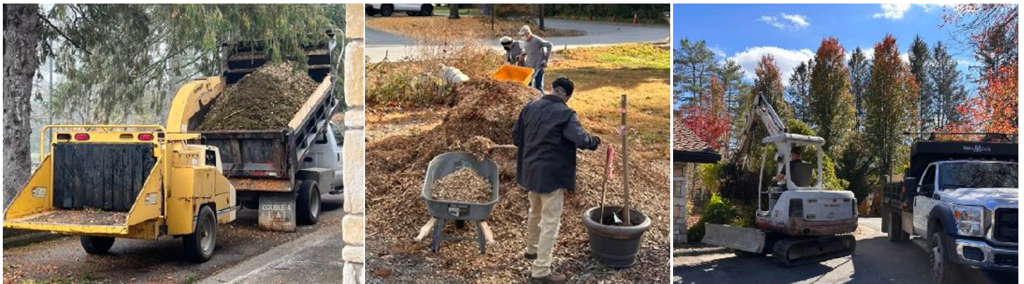
Above, trimmed branches are chipped and transported to the Fellowship Green, where Grow Getters Team members can use it to protect the work they have done on campus. At right, the Class 1 Invasive Nandina, which had defeated shovels, meets its match.

I am pleased to inform you that UUTC has been awarded a grant from the North Carolina Native Plant Society's B. W. Wells Stewardship Fund. Due to limited funds, we are only able to fund $900 towards the installation of a native bog garden on your campus grounds. Congratulations! Your award check of $900 will be mailed soon.