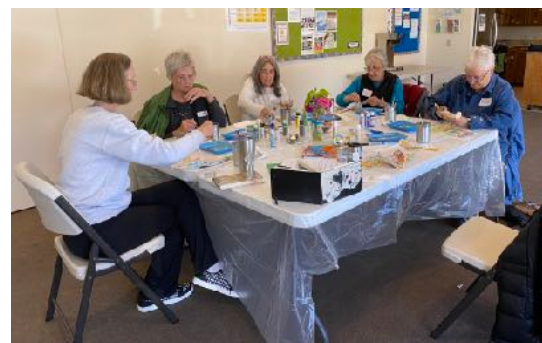
Blessing Bowl group had a great time!

This month's Circle includes paint. Be prepared with sacrificial clothing (just in case!). The sign up is on the front counter at UUTC. Get to church early and get to that front counter!