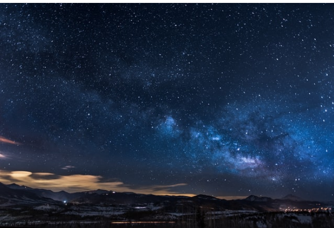
We will have an indoor Solstice Service on the 21st.

In my own life, I traveled for Thanksgiving with family, we're all vaccinated and each of us took at-home COVID-19 tests as we arrived together. Besides the holiday meal where it was just us, we went to restaurants and tipped well on some other days, and even went to a new blockbuster movie release (my son was savvy and bought tickets online, at a showing where we had the pick of any seat in the house). I'm looking forward to seeing the family here at UUTC for Christmas Eve services, something that was not possible last year.