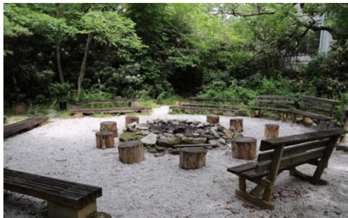
Almost fire weather!

Time, according to Issac Newton, “flows in and for itself without regard for outward objects” (including us humans). Newton’s view of time is unique in the sense that it is derived from a scientific perspective. It represents the mechanical view of time.