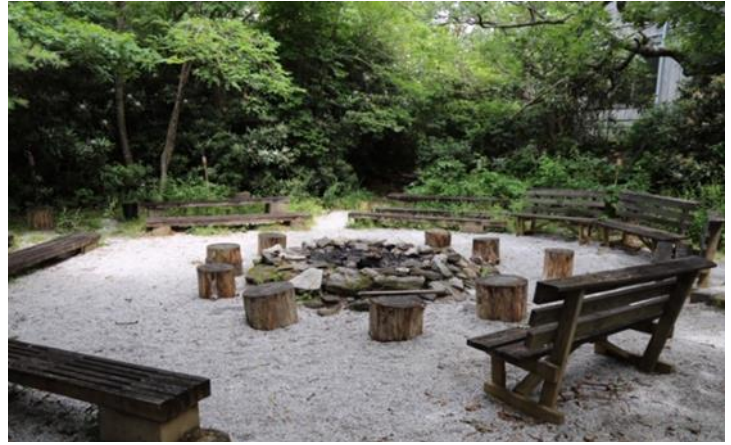
Almost fire weather!

Triple A recently published a report on the rise in the number of red-light running. The study spans a 10-year period and compares the number of fatalities in 2008 with those in 2017. According to the study there has been a 31% increase in the number of fatalities caused by those who run red lights. At least two people are killed every day by drivers “blowing through red lights”.