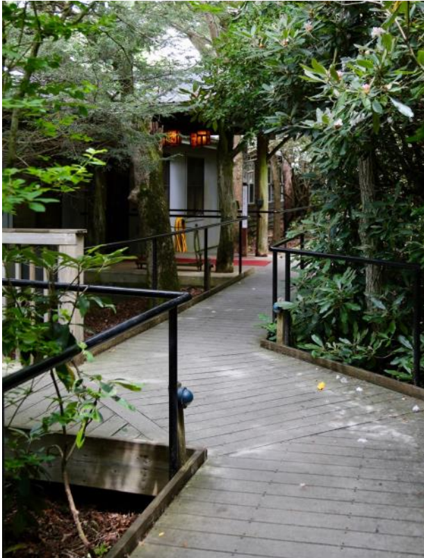
Path from the cabins to the Dining Hall