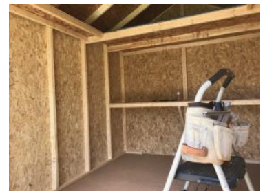
Stages of a shed — arrival, base set, completion of framing and installation of interior shelving.