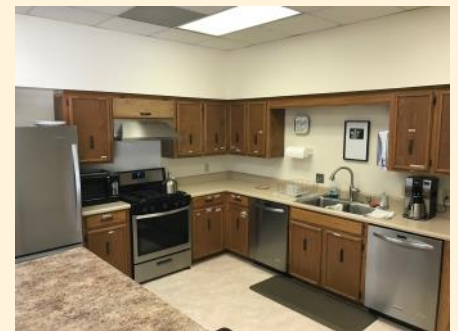
Previous Sponsored Projects include new cabinetry, new flooring in the classrooms and nursery, new appliances and new shelving in the nursery.