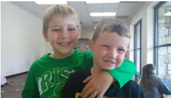
Below: "This Little Light of Mine, I'm Gonna Let It Shine!"