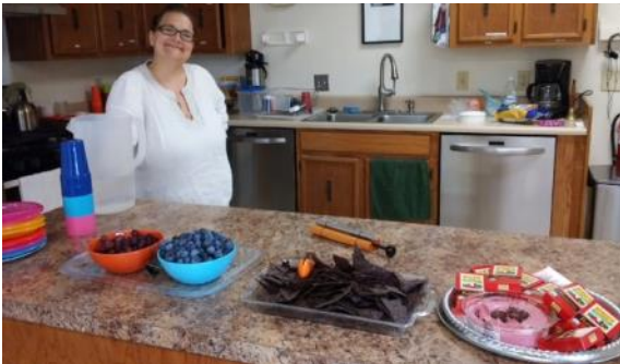
Healthy snacks are part of the routine!