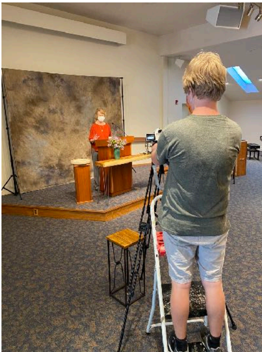
Setting up the second camera for the candles.

Since that time, Frank figured out how to connect these cameras to our OLD, OLD sound mixer/PA system, so we can use them to capture video outside with “less truck noise” sound quality. What that will mean besides the ability to record live singing outside for use on a Sunday morning we don’t know, but it gives us potential.