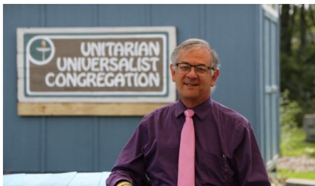
Come hang out with this guy!