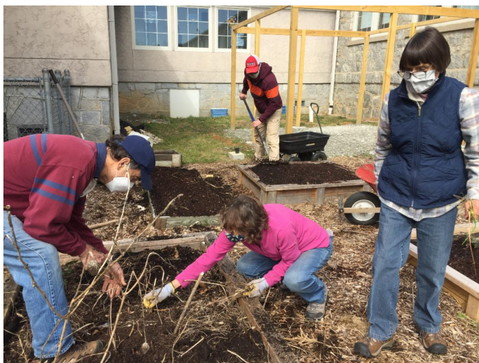
The Social Action Team at Davidson River School