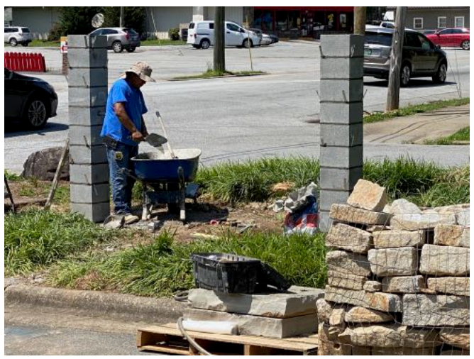
Work on the new sign moved forward in earnest this week, with footings excavated, rebar laid, concrete poured and columns built with a channel for electricity. Stone work begins today (Friday).