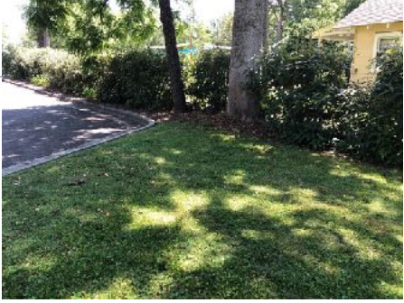
Play space fixtures going together (top, middle) and the space designated for Meditation Garden.

Along the creek, live stakes of elderberry and silky dogwood were