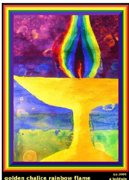
golden chalice rainbow flame

In this month of Pride, I hope you are proud and affirming of yourself and others, and I also remind you to be proud to be a Unitarian Universalist, a faith that stands strongly for the inclusion and wonder of all people -- LGBTQ, any skin color, any ethnicity, anywhere.