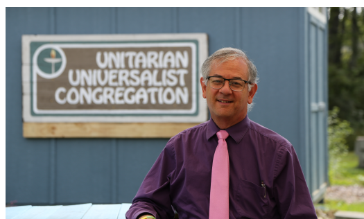
Come hang out with this guy!